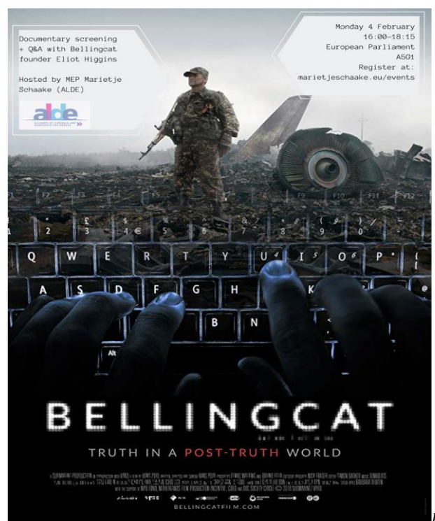
Poster of the Bellingcat documentary about Bellingcat featured at the European Parliament

Allegiance to Truth - we pledge allegiance to truth and evidence and abide by the principles of transparency and accountability