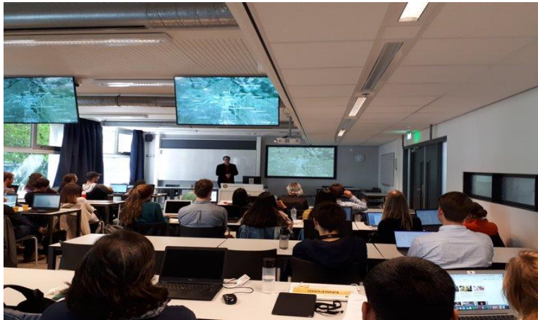
Bellingcat training workshop

The training courses of Bellingcat consist of a 5-day module (on-site or in-house), conducted by our own trainers and investigators. The income received is invested back into the organisation to cover operational costs (including salaries of researchers around the world) and fund various initiatives (to advance transparency and accountability) 14 . We offer training courses in five different languages (English, Dutch, Arabic, Spanish and Russian) and the workshops are generally divided into profit (the income of which we reinvest in the organisation) and non-profit (costs for which are covered by grants). For the training course we partner with a wide range of organisations, including the UC Berkeley School of Law, University of Toronto, University of Amsterdam, Agence France Presse, The New York Times, Süddeutsche Zeitung and numerous others.